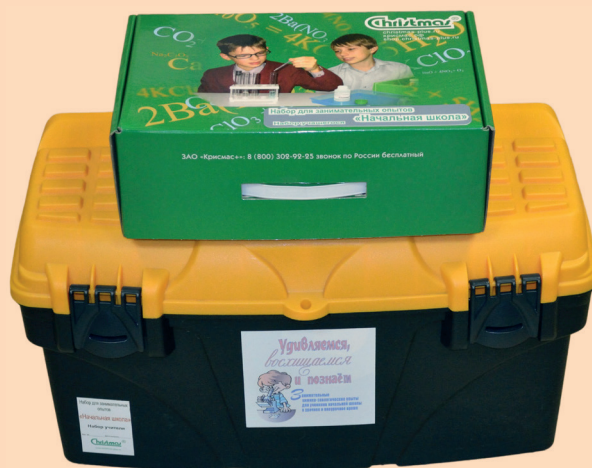
Closed teacher and student sets