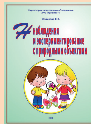
Methodical manual guide